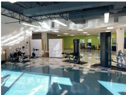
Moving, reconfiguring, spreading out--it's all in the name of social distancing and safety. A transformation of our Community Based Instruction (CBI) Learning Lobby (left) has turned that area into a fun and functional fitness space to meet students' needs for exercise and movement. Photos below: some new classroom configurations.