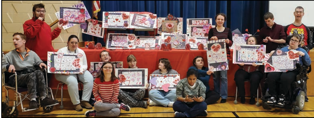
Some of the Adult Day Program crew proudly show off their Valentine's Day artwork.