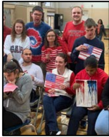
Salute to Veterans!