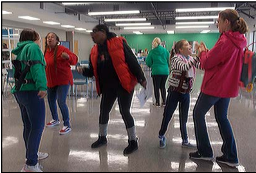
Friday Morning Dance Party! Students were greeted with music and dancing to start the day on a positive note and celebrate the end of another great week!