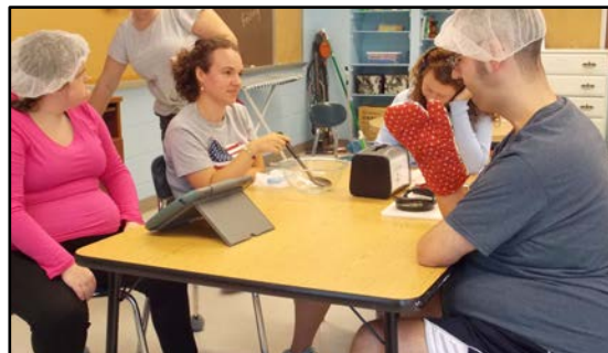
Getting ready to cook: clients and staff try various kitchen utensils and learn safe kitchen practices in preparation for a cooking class. First on the menu: apple chips!

Is your organization interested in teaming up with Kingsway Services' Adult Day Program? Contact Pat Horgan, Program Director, at 856-545-0800.