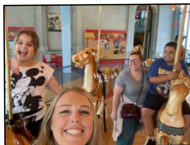
The Adventure Aquarium, left, and The Please Touch Museum, above, are always a big hit.