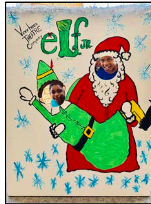
Students enjoyed a community production of "Elf."