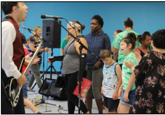
Rockin' with the Paisley Pickles! Kingsway is the band's favorite gig!

Kingsway students learn, play, explore, and celebrate during the Extended School Year Program.