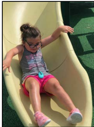
Students had a great time at Jake's Place, left, an all inclusive playground in Delran, NJ. There is also a Jake's Place in Cherry Hill, and one coming soon to Voorhees.

Back-to-School Night is Thursday, September 19