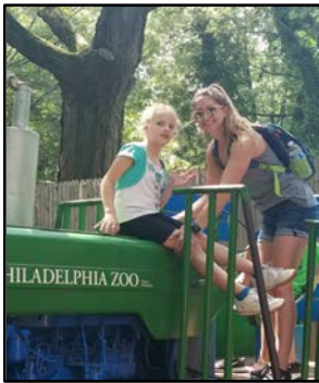
Classic fun and fascination at the Philadelphia Zoo.