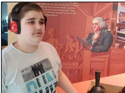
There's no place like Philadelphia to explore our nation's history.